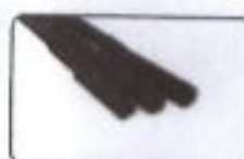
Connect to motor