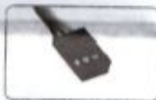
Connect to Receiver