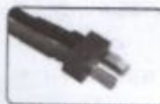
Connect to Battery